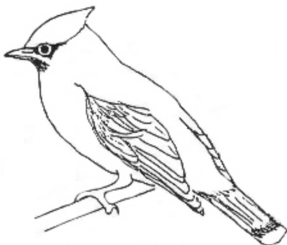
Humeral Fracture or injury to elbow joint