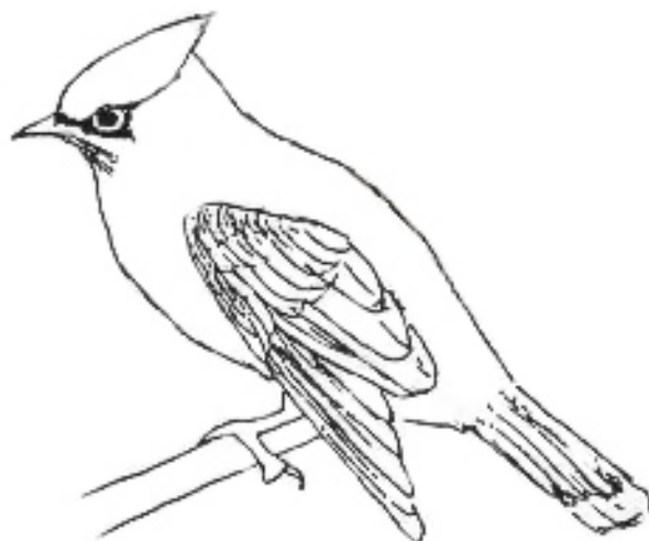
Carpal or Metacarpal fracture or injury to wrist joint